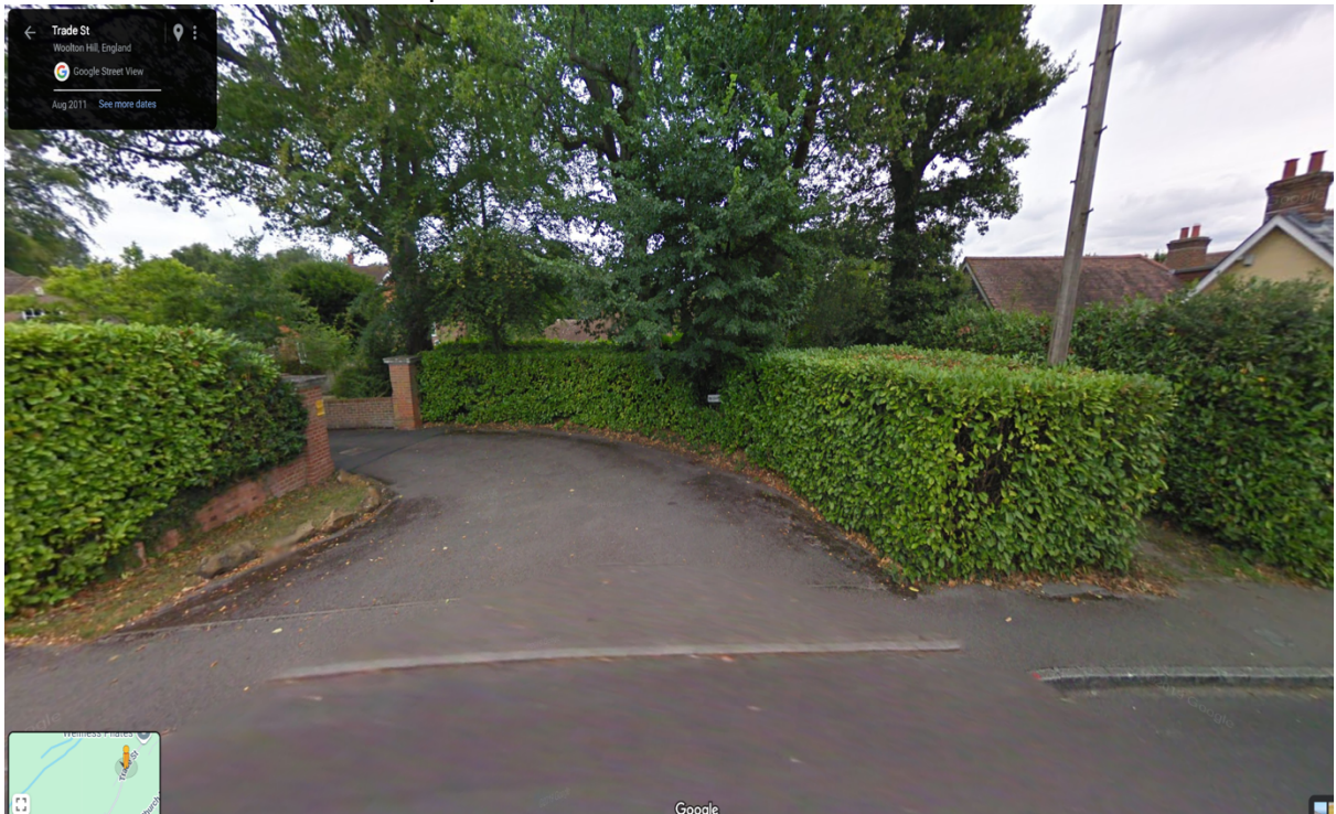
Interim 24 hour storage area for new boardwalk materials